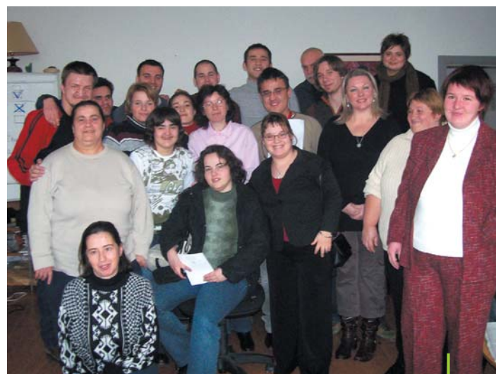
Training seminar with Self-advocates in Croatia (Croatian Association of Self-Advocates)

Parents will learn how to lobby, how to involve all the actors concerned and how to work with the media. The project also foresees exchange between Russian parents and other parents from member organisations of Inclusion Europe.