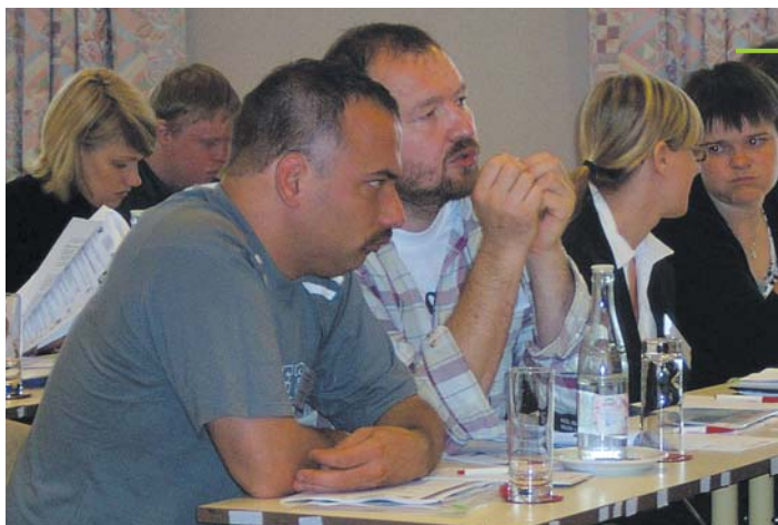
Final Conference of the project MMDP

The conclusions of the final conference of this project showed that various stakeholders as well as political and administrative structures need to be targeted in order to effectively mainstream disability policies. Self-advocates and families play a crucial role in this process.