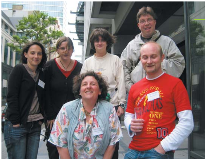
Europe in Action 2006 by Michal Daněk, from Inclusion Czech Republic (SPMP, Prague 5)

The General Assembly of Inclusion International, which took place following the World Congress, made a number of important decisions for the policy of the organisation. Policy papers on community living, children, legal capacity and education were adopted. These also provide guidelines for our European work in these areas.