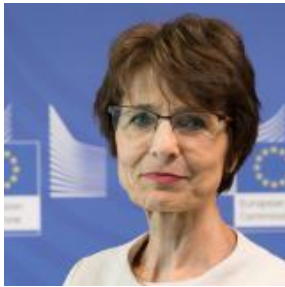
Marianne Thyssen European Commissioner.