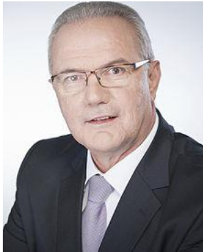
Neven Mimica European Commissioner.