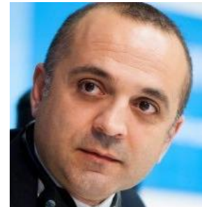
Mauro D'Attis Member of the European Committee of the Regions.