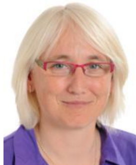
Olga Sehnalová Co-President European Parliament Disability Intergroup.