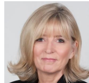
Corina Crețu European Commissioner.