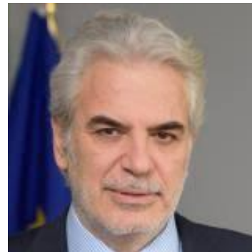
Christos Stylianides European Commissioner.