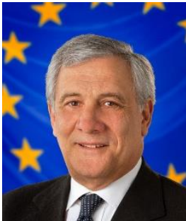
Antonio Tajani President of the European Parliament.