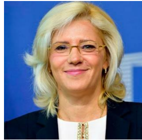
Emily O'Reilly European Ombudsman.