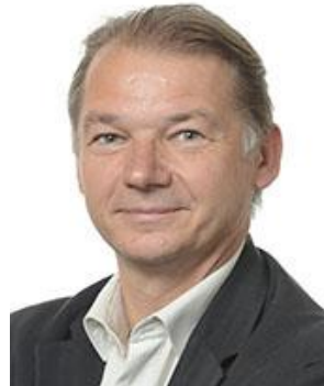
Philippe Lamberts MEP and Co-President of a European party.